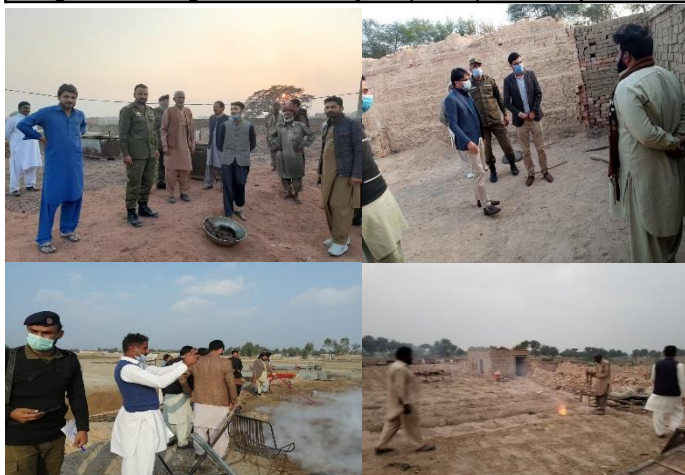
Drive to convert traditional brick-kilns into zigzag methodology continues vigorously